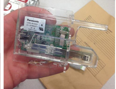
A credit-card reader/writer.