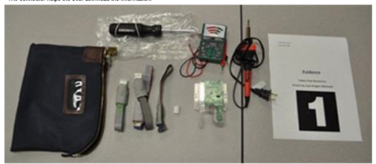
Skimmer, card reader/writer, screwdriver, voltage meter to test the connection when making the skimmer, and soldering gun to connect everything.