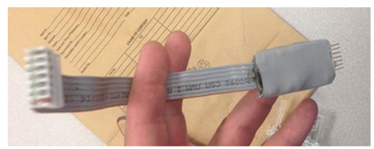
The skimming device