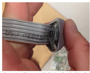
A connector and the computer chip that stores the stolen information. The connector helps the thief download the information.